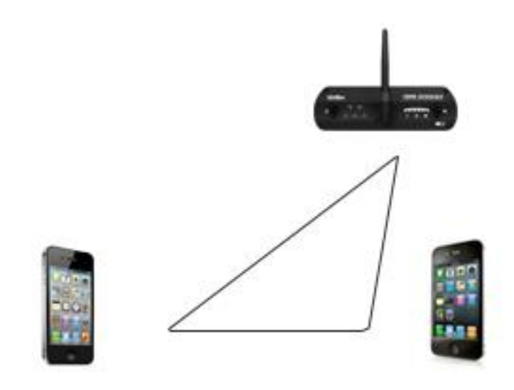
Figure 3 - For Audio A2DP, Position Closer to SINK DUT