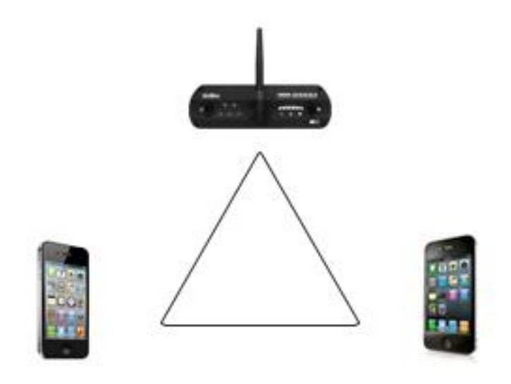
Figure 1 - Devices Equally Spaced in the Same Horizontal Plane