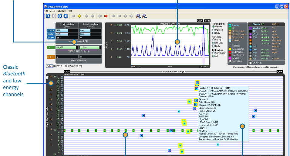
Classic and low energy packets in a single view

Throughput graphs for average, 1 second and throughput over time.