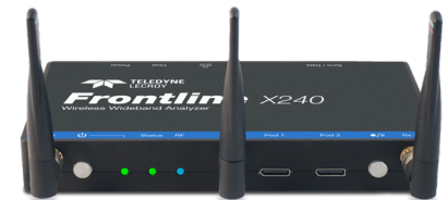
The conformanceHarmony LE Tester includes the powerful Frontline X240 Wireless Wideband Analyzer

Knowing that your IUT failed a test is important for conformance, but the conformanceHarmony LE Tester provides more than just a pass, fail or inconclusive result for conformance certification - it is a sophisticated protocol analysis and tester platform, providing test case logging and debugging. The conformanceHarmony LE Tester summarizes and helps to pinpoint the cause of a fail or inconclusive verdict with detailed information to help understand and debug each failure.