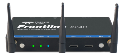
The conformanceHarmony LE Tester includes the powerful Frontline X240 Wireless Wideband Analyzer

Knowing that your IUT failed a test is important for conformance, but the conformanceHarmony LE Tester provides more than just a pass, fail or inconclusive result for conformance certification - it is a sophisticated protocol analysis and tester platform, providing test case logging and debugging. The conformanceHarmony LE Tester summarizes and helps to pinpoint the cause of a fail or inconclusive verdict with detailed information to help understand and debug each failure.