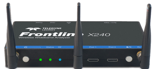
Optional to the testHarmony LE Exerciser is the addition of the powerful Frontline X240 Bluetooth LE Protocol analyzer to capture and debug OTA and HCI traffic.

The testHarmony LE Exerciser is a sophisticated protocol analysis and tester platform, providing test case logging and debugging, with the detailed information necessary to help understand and debug each failure.